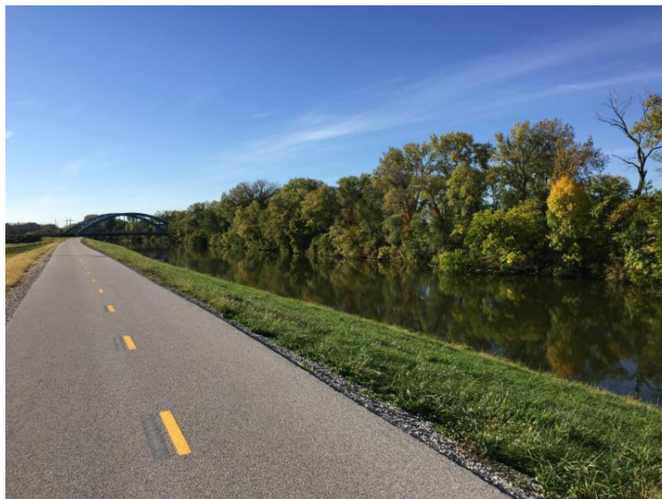
Enjoy the views on the Hennepin Canal Parkway!

Explore a piece of scenic history this summer on the Hennepin Canal Parkway: Milan Section, a 7-mile network of bicycle and pedestrian friendly trails. Opened in 1907, the Hennepin Canal made commerce between the Mississippi and Illinois Rivers possible and is now listed on the National Register of Historic Places. The entire Hennepin Canal Parkway stretches 104.5 miles across Illinois, from Bureau Junction to Milan. Today, visitors can admire views of the confluence of the Mississippi and Rock Rivers at Lock 32, enjoy a picnic, or try a hand at fishing on